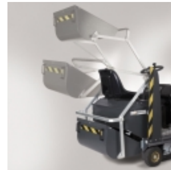
ML 3 With the version with the electric emptying system, dirt can be emptied directly into a container up to a height of 1,5 m by simply using a switch from the driver's seat.