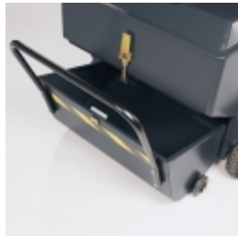
ML 1 In the basic model the large dirt hopper can be removed and easily carried away for emptying.

The traction, either hydraulic or electric, is provided