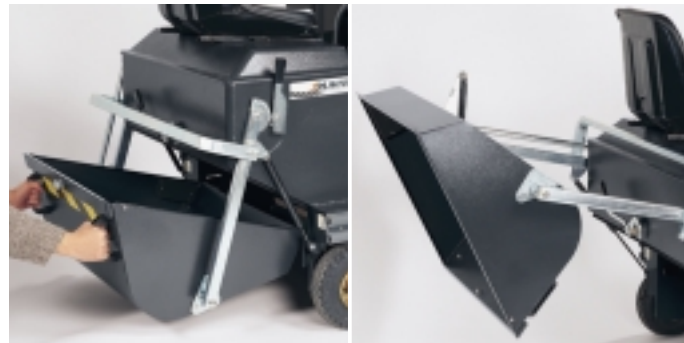
ML 2 The mechanical dumping system enables emptying up to 1 m. height. (Choice of direct collection into proper plastic containers which are available as an optional kit).