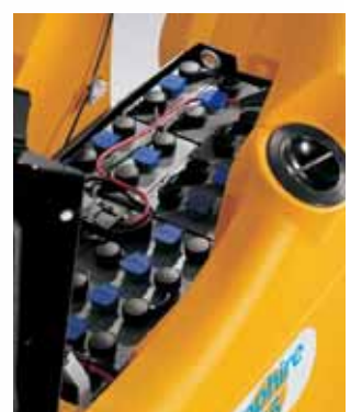
BATTERIES Big battery compartment of easy access for any type of maintenance: fits batteries of high capacity. Working autonomy of four hours continuously.